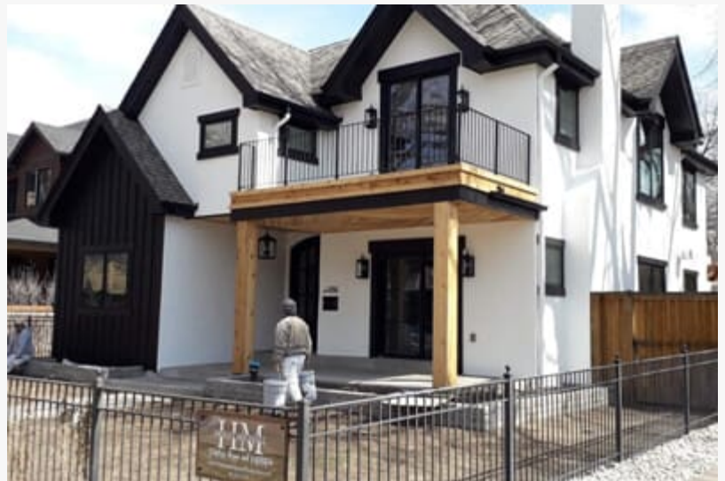
Exterior Painting in Denver, CO