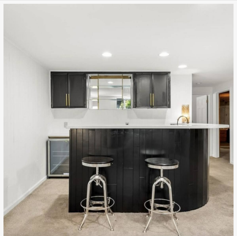
Interior Painting in Denver, CO

While the company's name Denver's Best Painters points to its long presence in the area, the release of this information is not intended as a claim of superiority over any other provider. Instead, reaching a 28-year milestone in a competitive market underscores the role of consistency and adaptation in a service business. For many homeowners, finding a contractor