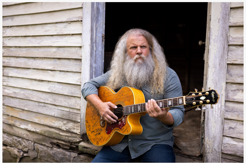
Jamey Johnson