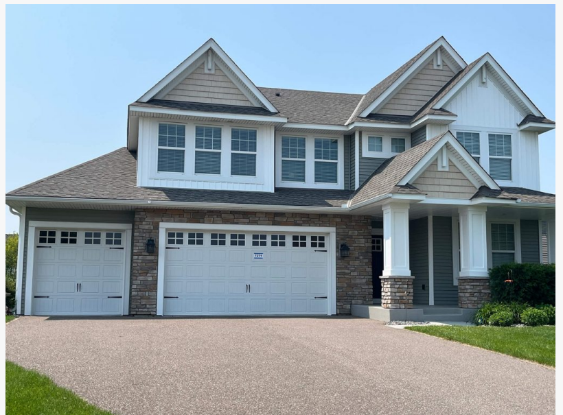
Exterior Painter in Ramsey, MN