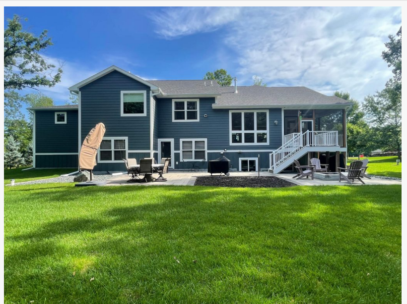
Exterior Painting in Ramsey, MN