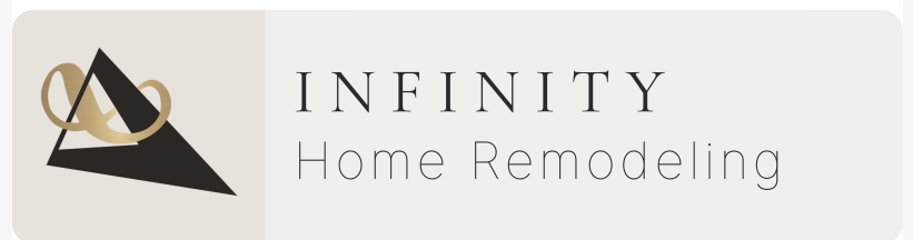
Infinity Home Remodeling Logo