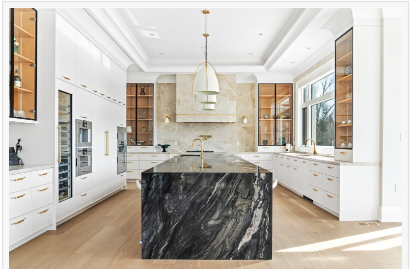
Home Remodeling Scottsdale