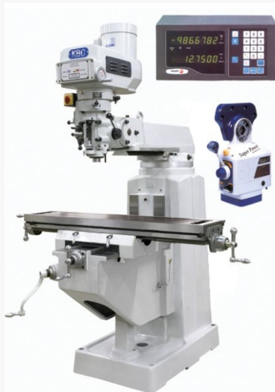
KBC TUM Milling Machine with Newall DRO & 3 Year Warranty