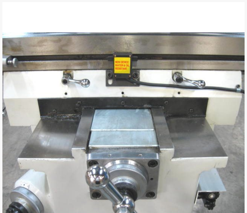
Wide support for milling table

This press release can be viewed online at: https://www.einpresswire.com/article/891122586