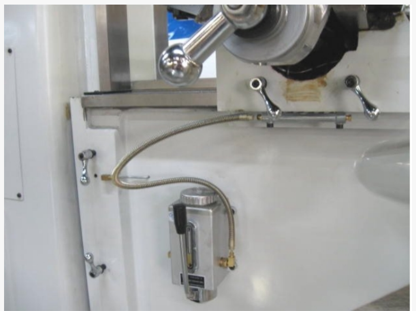
Close up of lubrication system and DRO install