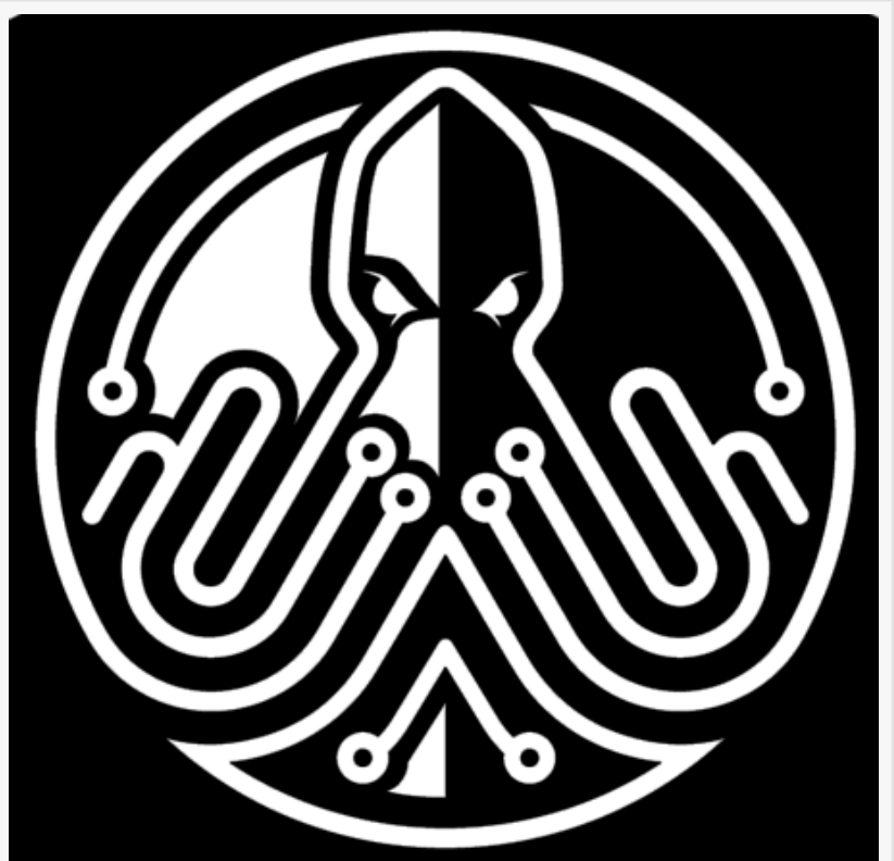
Overwatch Mission Critical

Through its workforce solutions, construction, and training divisions along with Patriot Power Services, its load bank rental and fleet management company, Overwatch develops and deploys skilled labor at scale to meet the growing demands of the data center industry. Overwatch's broader mission is to expand the national talent pipeline by training and integrating new entrants into the data center workforce. This approach accelerates campus delivery, drives job creation, and strengthens America's infrastructure, competitiveness, and technological self-reliance.