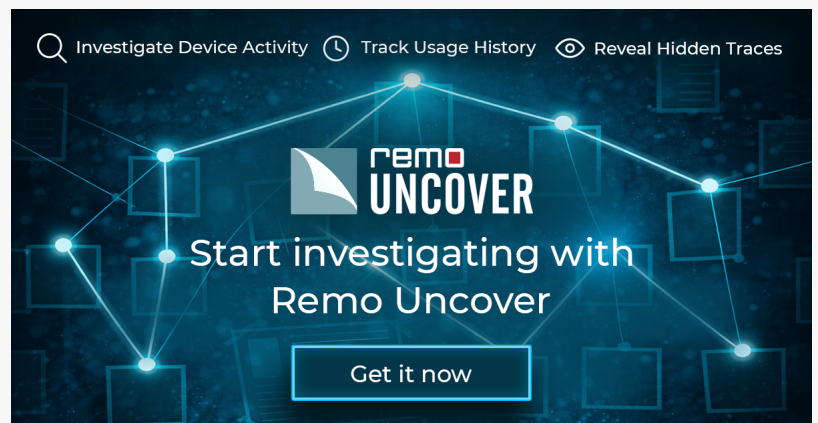
Remo Uncover - Simple Forensics Tool