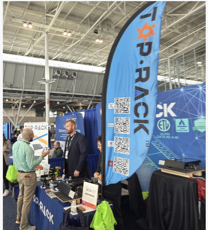
Top Rack at RE+ Northeast Boston 2026