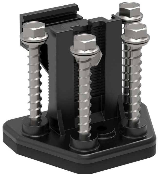
Top Rack Pre-assembled Components to reduce labor time and on-site complexity