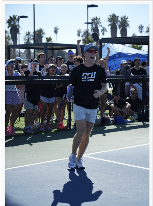
High-energy sideline support fuels championship play at an NCPA collegiate pickleball event