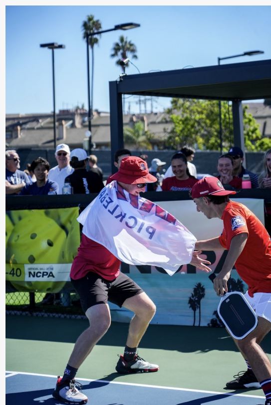
Teammates celebrate an emotional championship moment during NCPA collegiate pickleball competition

This press release can be viewed online at: https://www.einpresswire.com/article/891496557