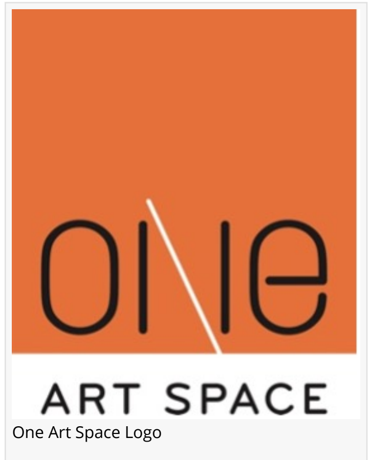
One Art Space Logo