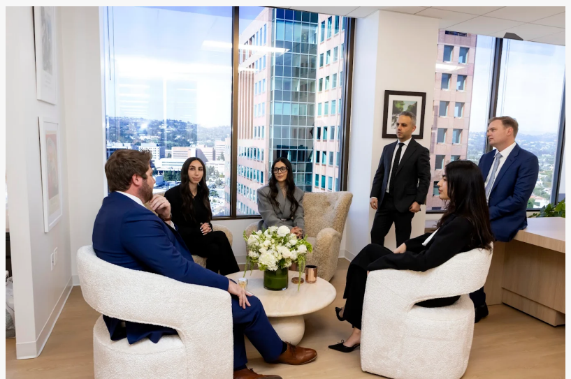
Hillstone Law Accident & Injury Attorneys

LOS ANGELES, CA, UNITED STATES, February 12, 2026 /EINPresswire.com/ -- Hillstone Law, https://hillstonelaw.com/ a leading personal injury and accident law firm serving clients across California and Nevada, announces the launch of its fully dedicated Spanish-language legal team to better serve the Hispanic community.