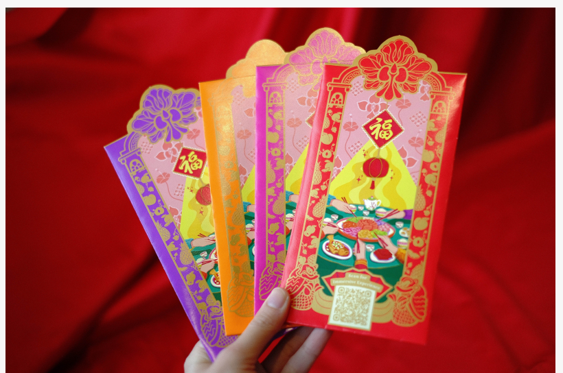
The CNY 2026 "Blessing of Reunion" AngBao available in four distinctive colorways

The augmented reality layer, powered by HOVARLAY's no-code AR platform, transforms the red packet from a one-time festive exchange into a living lo hei ritual. Families and friends can relive the moment of reunion by interacting with digital blessings together, bridging generations that may feel increasingly distant from traditional practices.