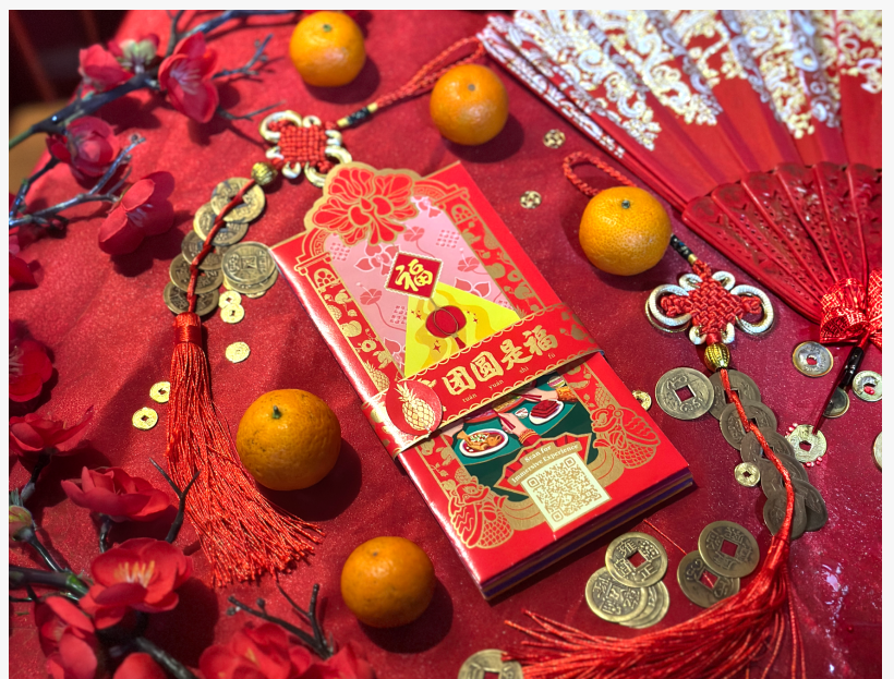
"The Blessing of Reunion" angbao displayed with traditional Chinese New Year elements

SINGAPORE, SINGAPORE, SINGAPORE, February 12, 2026 /EINPresswire.com/ -- Creativeans, together with Fujifilm, OVOL, HOVARLAY, and Musa 24 Hours Printing, has launched Singapore's first glueless Chinese New Year red packet with an augmented reality experience. The fully recyclable hongbao brings a lo hei reunion scene to life when scanned with a smartphone, transforming the red packet into an interactive moment where digital blessings can be tapped and tossed together.