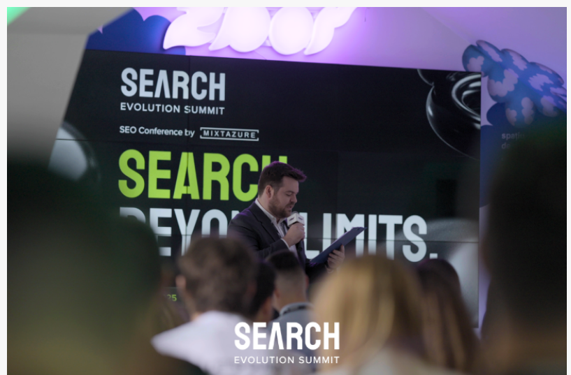
Search Evolution Summit presenter from the 2025 edition

Early birds tickets for the 2nd edition of Search Evolution Summit are available