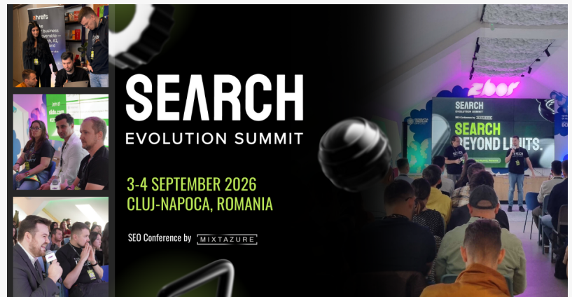
The 2nd edition of Search Evolution Summit 2-4 September 2026 Cluj-Napoca, Romania

CLUJ-NAPOCA, CLUJ, ROMANIA, February 12, 2026 /EINPresswire.com/ -- Search Evolution Summit is back for a second edition. The SEO conference, organized by Mixtazure, runs 2-4 September 2026, in Cluj-Napoca, Romania. After drawing 100 participants and 12 speakers in its single-day 2025 debut, the event now stretches across three days with advanced SEO workshops and Romanian-language panels added to the schedule. This year's edition expects 200 participants.