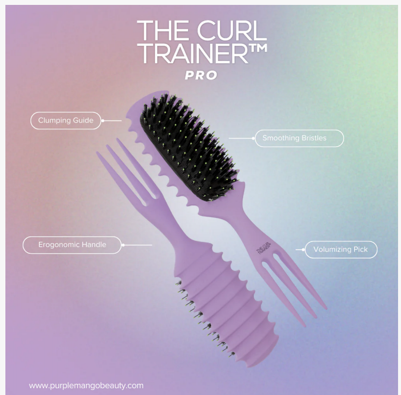
Purple Mango Beauty is Delivering The Newest, Innovative Hair Brush & Styling Tool For Curly Hair