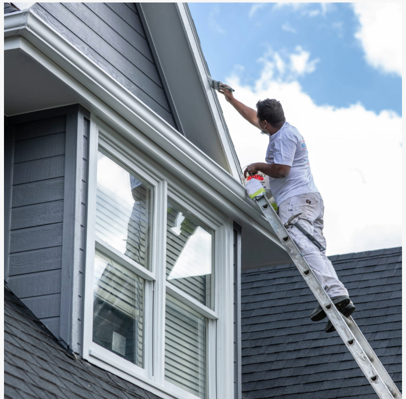
Exterior Painting in Kansas City, MO