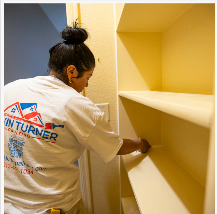
Interior Painting in Kansas City, MO

Industry recognition also plays a role in the company's evolution. Kevin Turner Painting is known locally as the Kansas City area's only nationally awarded residential repaint specialist, a distinction that underscores its skill and