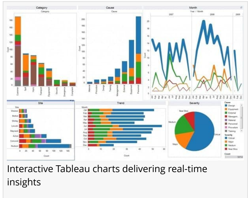
Interactive Tableau charts delivering real-time insights

The integration of Jumbula with the Tableau from Salesforce platform delivers a unified