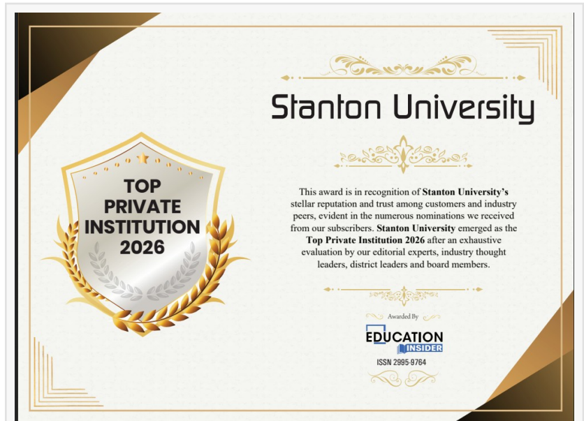
A proud moment for Stanton University.

This commitment is exemplified in standout programs like Information Systems Management. The curriculum is intentionally designed to cultivate not just technical experts, but strategic and ethical leaders. By focusing on critical areas such as cybersecurity, data governance, and systems integration, Stanton prepares graduates to responsibly manage the digital infrastructure that