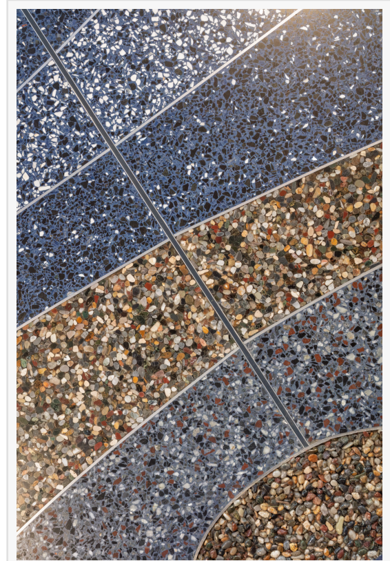
Kankakee Welcome Center's terrazzo in shades of blue, with river rock and a rustic finish represents Indiana's waterways.

The annual NTMA Honor Awards recognize outstanding terrazzo installations completed by association member contractors. Entries are evaluated by design professionals and terrazzo specialists on design, craftsmanship, and technical execution. A full list of this year's 17 Honor Award recipients is available at ntma.com .