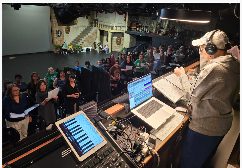
Recording in the NarroWay Theatre

While the soundtracks drop on February 15, pre-save links for Spotify are available on NarroWay’s website now. When guests sign up on the pre-save link, music will appear in their playlists as soon as the albums go live. Additional quick links will be available on the site once