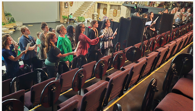
More than 100 ladies recorded vocals on the track.