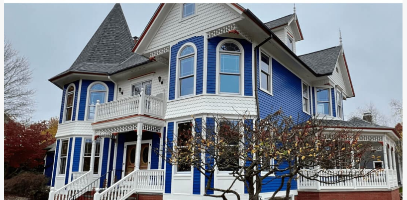
Exterior Painting in Providence, RI