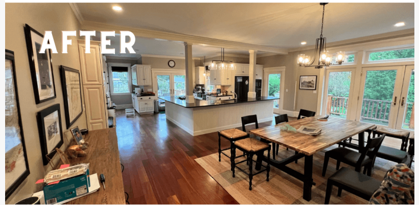
Interior Painting in Providence, RI