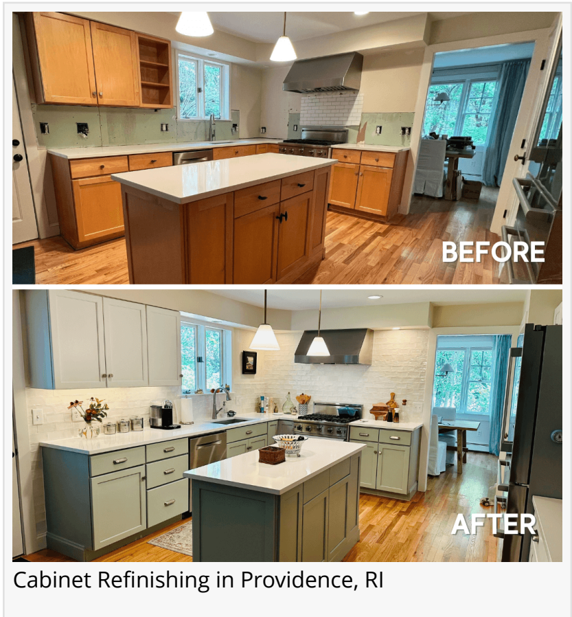
Cabinet Refinishing in Providence, RI

This press release can be viewed online at: https://www.einpresswire.com/article/891996030