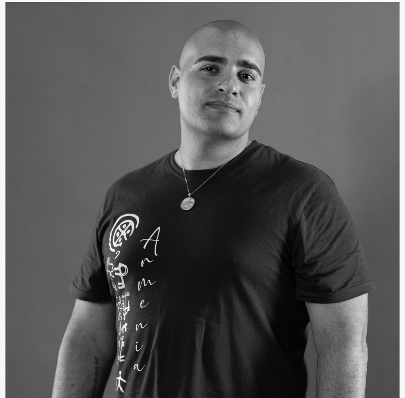
Founder Of Levels of Self & 100LevelUp.com