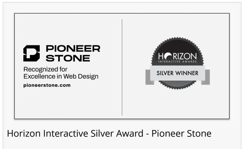
Horizon Interactive Silver Award - Pioneer Stone

These features ensure that whether a visitor is planning a large-scale commercial façade, a multifamily development, or a high-end residential project, they can move seamlessly from inspiration to implementation.