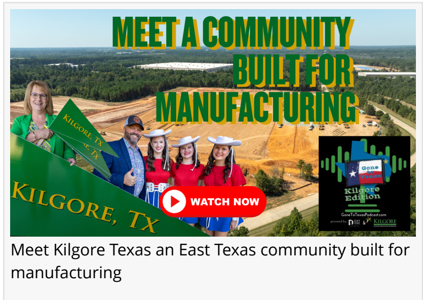
Meet Kilgore Texas an East Texas community built for manufacturing

FRISCO, TX, UNITED STATES, February 16, 2026 /EINPresswire.com/ -- Kilgore, Texas, economic development and East Texas manufacturing are being highlighted in a new Spotlight Series on the Top 5 "Gone to Texas" business podcast, showcasing the community's competitive advantage in precision manufacturing, workforce development, and industrial expansion.