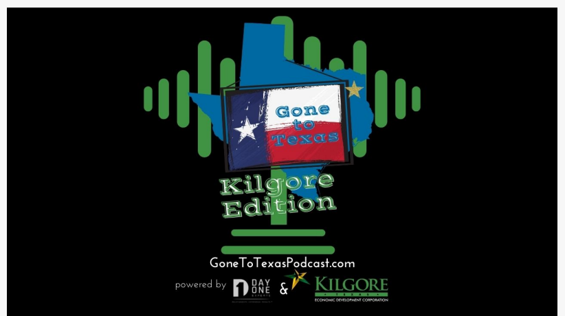
Kilgore Texas Featured on Gone to Texas Podcast

Episodes of the Kilgore Spotlight Series on the Gone to Texas Podcast are available at: GonetoTexasPodcast.com/kilgore-spotlight-series