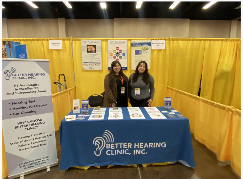
Better Hearing Clinic Staff Attend Winter Texan Expo