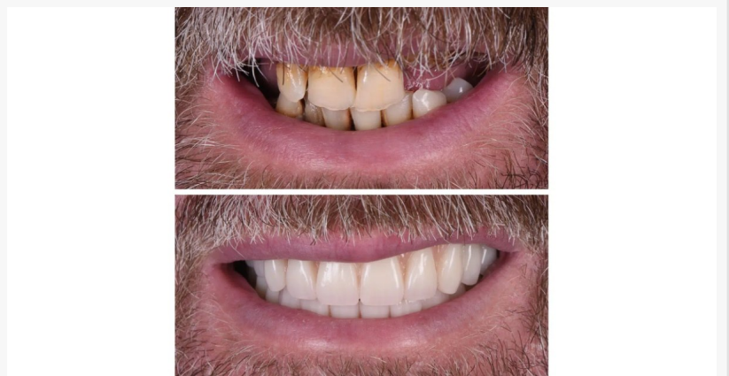
Dental Implant Patient Results