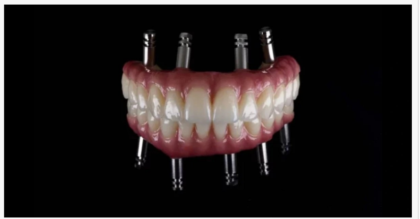
All-on-4 Dental Implants Brisbane

detailed assessment, photographs and an OPG X-ray. Once the assessment is complete, our team develops a customised treatment plan tailored to each patient.