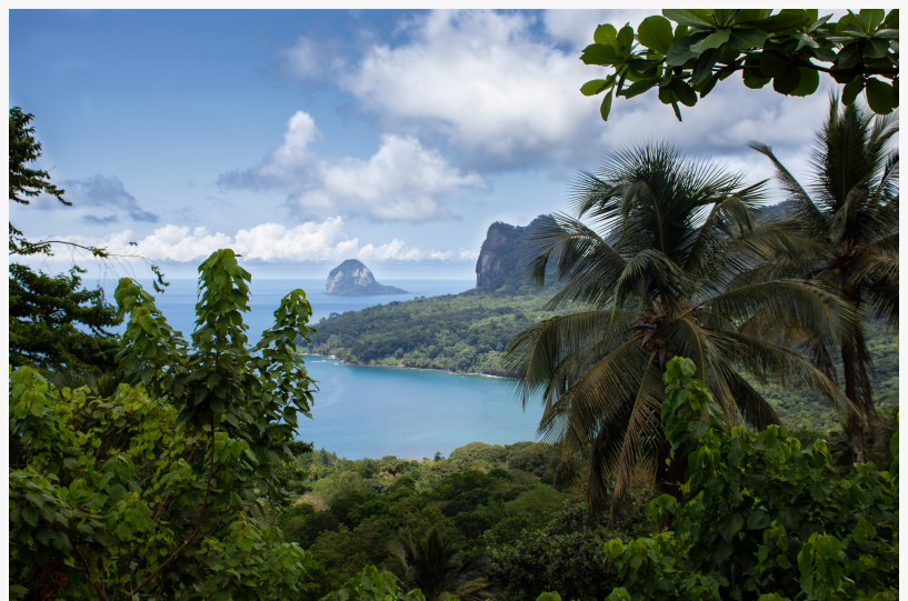
São Tomé and Príncipe citizenship by investment 2026

For international investors, this confirmed that a new jurisdiction had formally entered the citizenship by investment market, with defined application procedures and timelines.