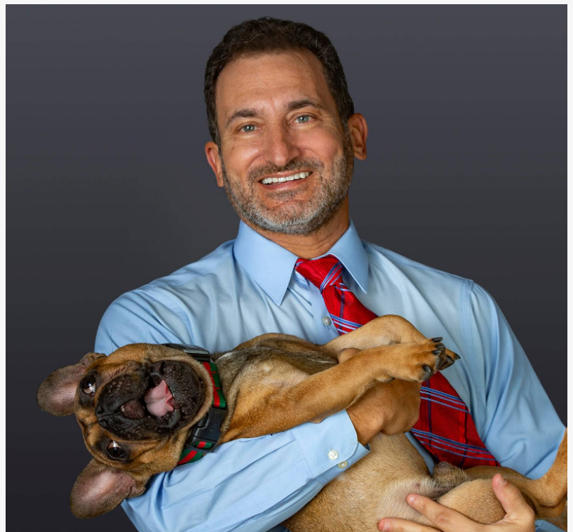
Marc L. Shapiro Photo