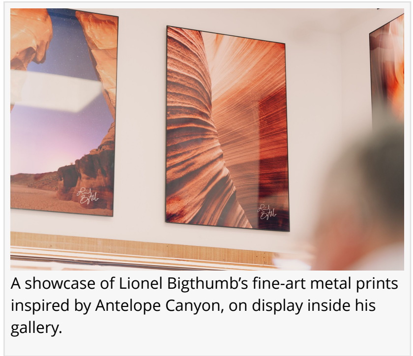
A showcase of Lionel Bigthumb's fine-art metal prints inspired by Antelope Canyon, on display inside his gallery.

The interplay between light and shadow is central to Antelope Canyon photography. Soft beams illuminate textures etched into the sandstone, revealing curves and layers formed over centuries. As the light moves, the canyon's colors shift from deep rust to warm gold, creating images that feel alive and dimensional.