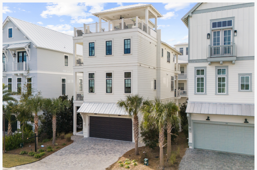
Inlet Beach, FL 32461

INLET BEACH, FL, UNITED STATES, February 17, 2026 /EINPresswire.com/ -- Interluxe Auctions, the premier online luxury real estate auction marketplace, is pleased to announce the upcoming online auction of The Grande Pointe Retreat, a fully furnished coastal estate in Inlet Beach's Grande Pointe community, located between Lake Powell and the Gulf. Built in 2023 and designed for effortless coastal living, the property features elevator access to all levels, multiple expansive balconies, and a rooftop terrace with Gulf views, creating an elevated setting that suits the signature indoor-outdoor lifestyle of 30A.