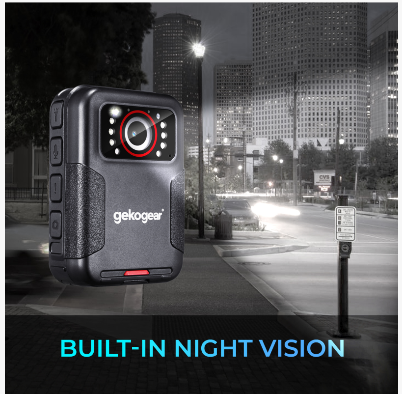
Aegis 110 Body Cam Night Vision