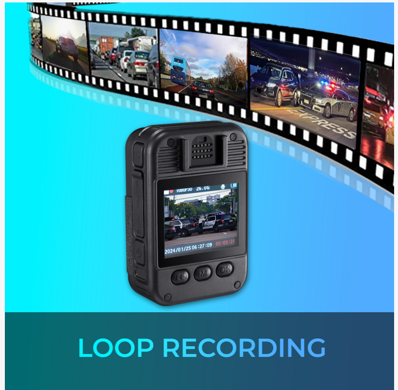
Aegis 110 Body Cam Loop Recording