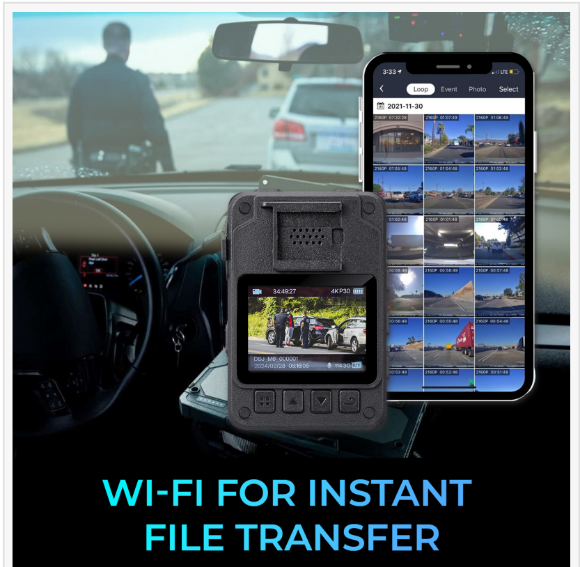
Aegis 400 Body Cam WiFi

Footage from personal body cameras has increasingly played a role in documenting enforcement actions, clarifying disputed accounts, and supporting legal or public review. In environments where trust in official narratives may be strained, independent documentation can serve as an important safeguard.