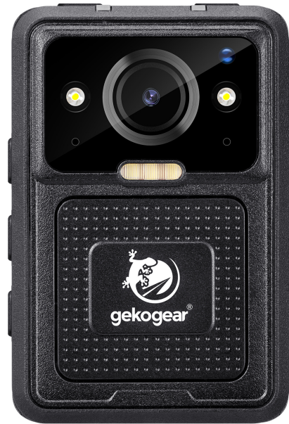
Aegis 400 Body Cam

For users who want more powerful capabilities, the Aegis 400 4K UHD Body Cam delivers ultra-