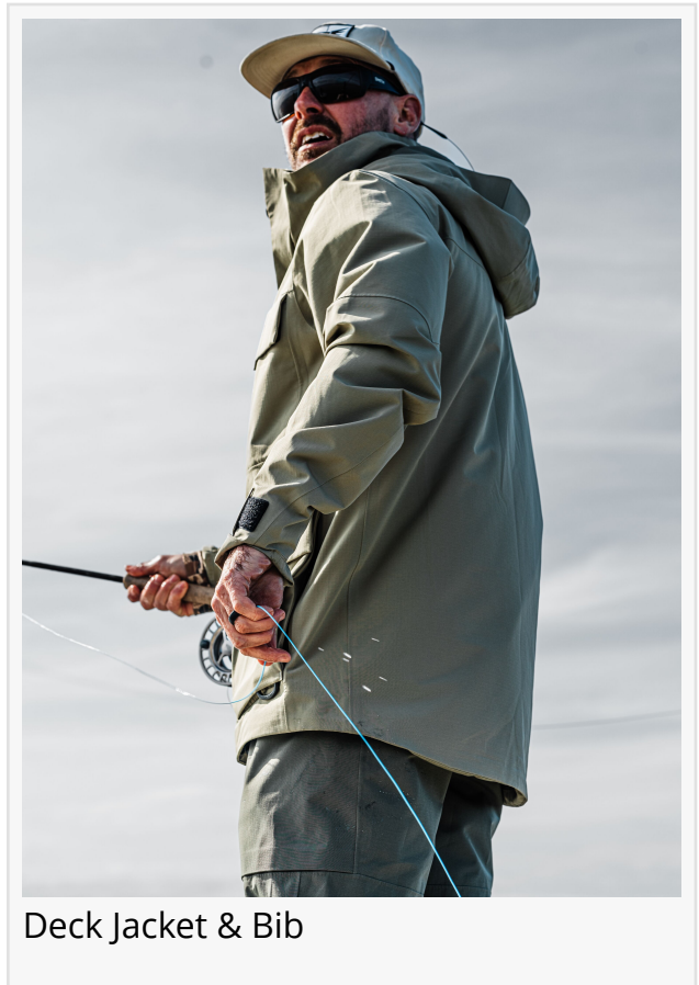
Deck Jacket & Bib

Women’s Lightweight Rockport Hoodie – Built with brrr® fabric technology, the new Duck Camp Women’s Lightweight Rockport Hoodie delivers cooling coverage that moves with the user. Its quick-dry, moisture-wicking fabric combines incredible comfort with 40+ UPF sun protection. A 3-