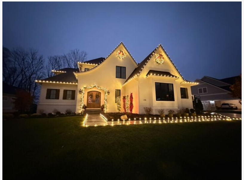
Pink's Windows North Indy Holiday Light Install

The new service marks a strategic expansion for the company, allowing customers to experience the same uniform, consistent, and professional service standards they rely on year-round — now applied to custom holiday lighting design and installation.