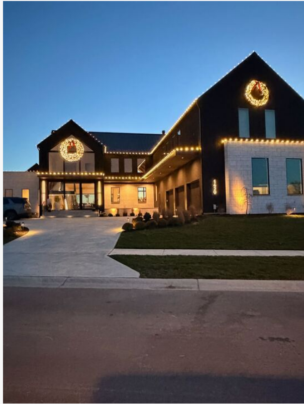
Pink's Window Services North Indy Holiday Light Installation