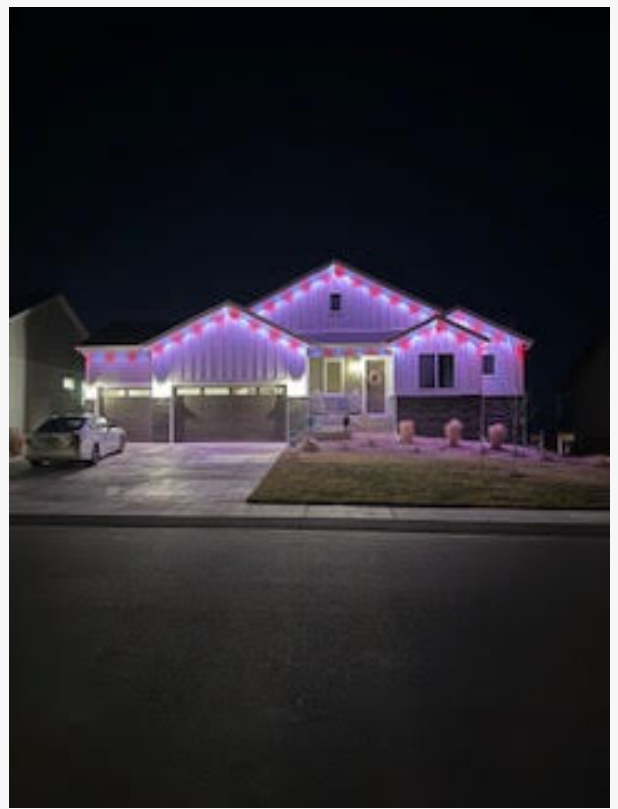
Pink's Window Services Colorado Springs Light Installation

Scheduling for the 2026 holiday season will officially open in late summer 2026. Due to anticipated demand and the seasonal nature of installation, early booking will be strongly encouraged. Priority