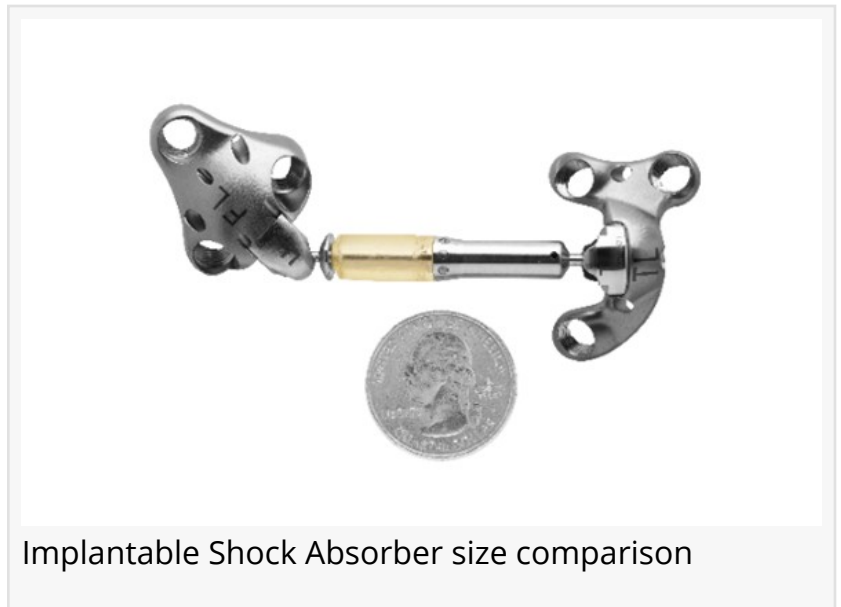
Implantable Shock Absorber size comparison