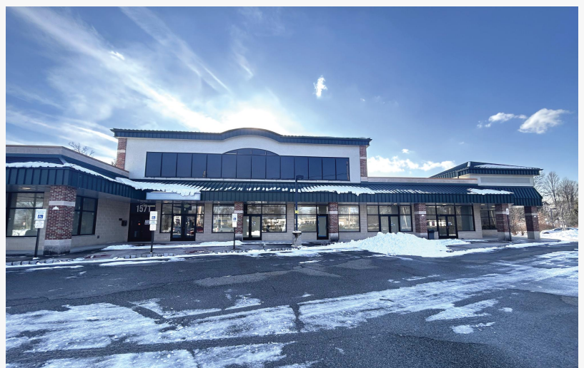
1571 Route 46, Parsippany, NJ

CLINTON, NJ, UNITED STATES, February 19, 2026 /EINPresswire.com/ -- Max Spann Real Estate & Auction Company announces an upcoming Commercial Real Estate Portfolio Auction to be held March 18th, featuring a diverse selection of commercial and development-oriented properties located throughout New Jersey, Pennsylvania, and Georgia. The offering includes retail investment property, commercial development land, and strategically positioned commercial sites suited for investors, developers, and owner-users.