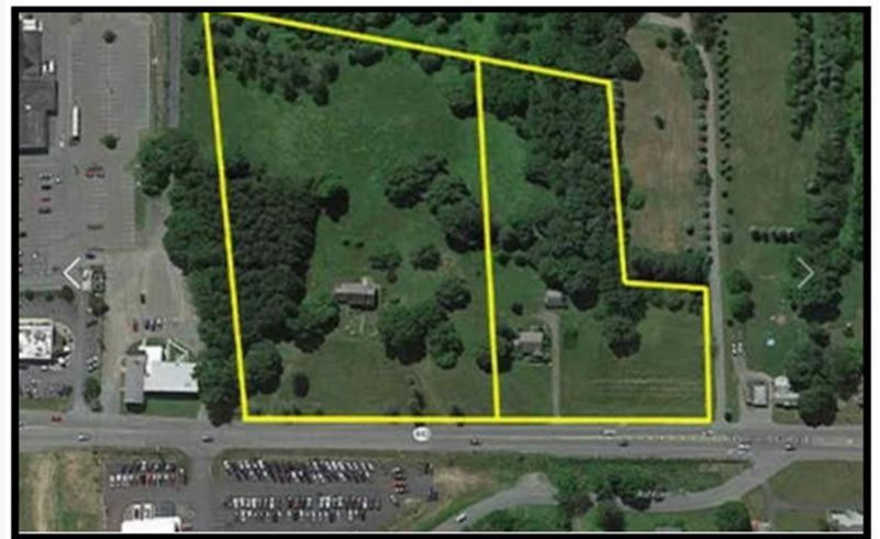
1461-1511 Blakeslee Blvd Dr E, Lehighon, PA