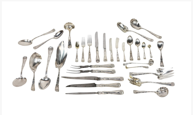
Tiffany & Co 175-piece sterling flatware set in the 'Wave Edge' pattern, monogrammed 'GGS,' weighing in at 225.86 ozt. Estimate: $16,000-$18,000