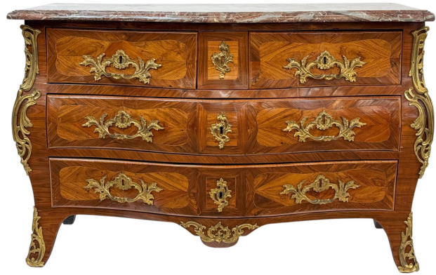
18th/19th-century French Louis XV bombe commode chest with red marble top and five drawers, marquetry and parquetry inlaid, with secondary oak, 54 inches wide. Estimate: $1,000-$2,000

A 1984-1986 bronze sculpture by Jonathan Silver (NY, 1937-1992), titled "Birth of Venus," measures 86 inches tall by 17 inches wide and is estimated to ring up $1,000-