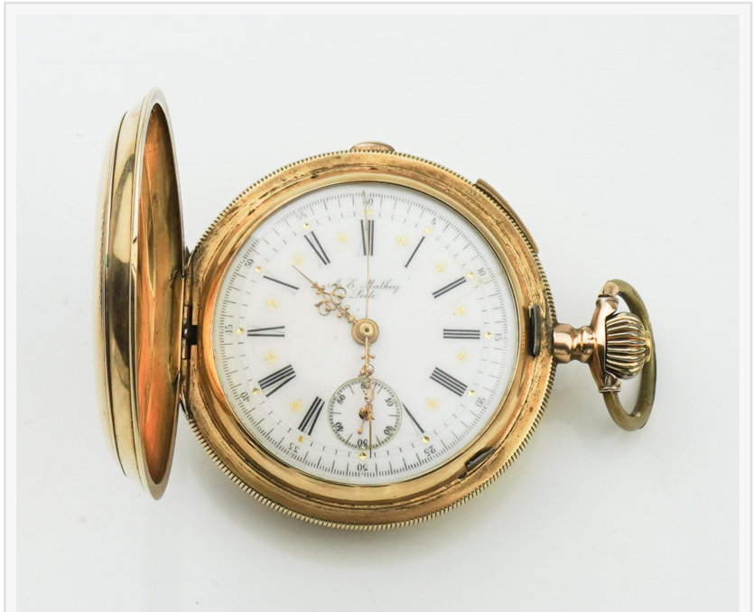
A E Mathey Repeater pocket watch stamped and tested 14K yellow gold, sporting a white dial with black Roman numerals and fancy gilt hands, the gross weight 71.16dwt. Estimate: $5,000-$7,000

An exquisite selection of silver includes a Reed and Barton Francis I flatware service, a German Bruckmann and Sohne tea set, and what may end up being the sale's top lot, a 175-piece Tiffany & Co sterling flatware set in the "Wave Edge" pattern . Monogrammed "GGS," the set weighs in at