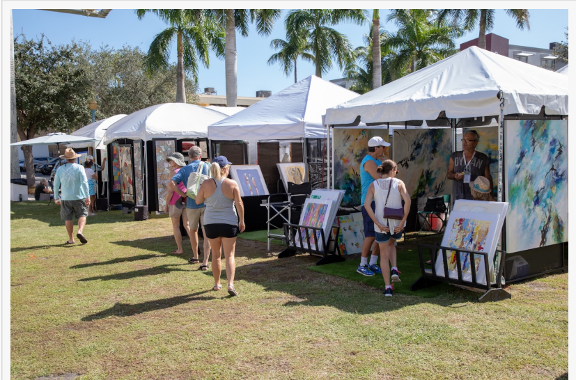
Art on the Square Lawn

The Cornell Art Museum is housed within the original Delray Elementary School building, which was built in 1913. The Museum hosts several curated fine art exhibitions each year featuring notable regional, national and international artists. It also has a Museum Store displaying original works by regional artists. The City of Delray Beach purchased the historic building on the Old School Square campus from the Palm Beach County School District in 1987. The building was named after benefactors George and Harriet Cornell in 1990, before being renovated in 2017