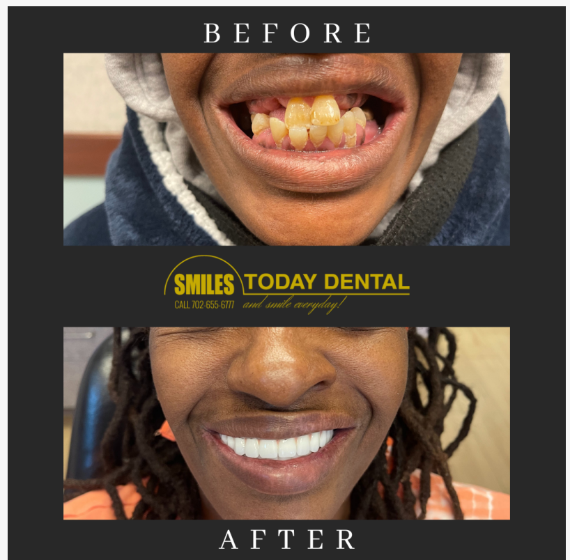
Before and After Dental Implants (female patient)