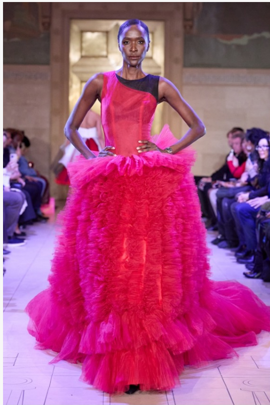
Malan Breton AW2026 Collection