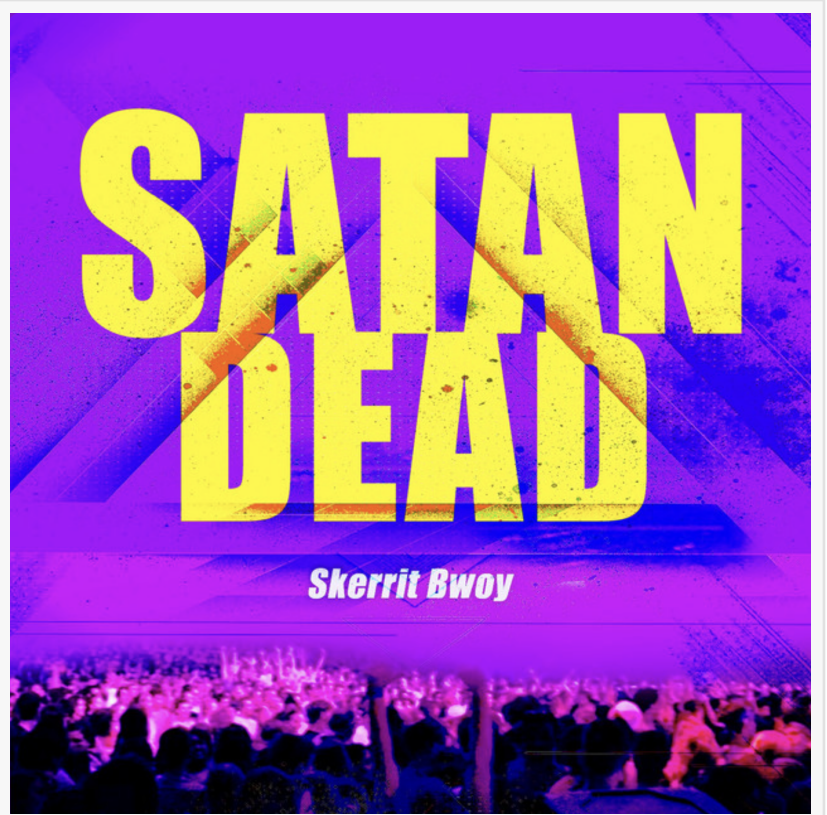
Skerrit Bwoy "Satan Dead" - single cover artwork

This press release can be viewed online at: https://www.einpresswire.com/article/894182879