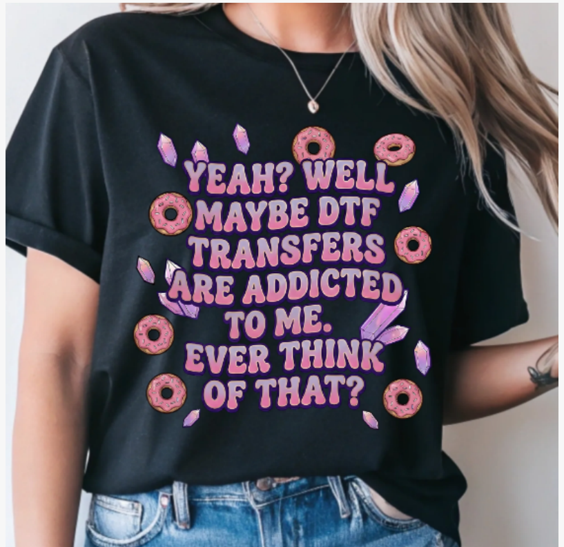
Crystal DTF shirt design