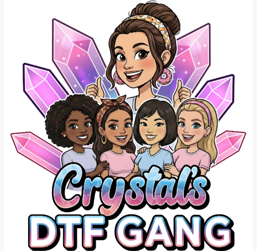
Cartoon of the Crystal DTF Gang