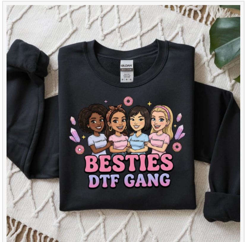
Besties DTF Gang sweatshirt

Another critical factor is the utilization of the "gang sheet" method, where multiple designs are nested onto a single continuous roll of film. Crystal DTF's proprietary software optimizes these