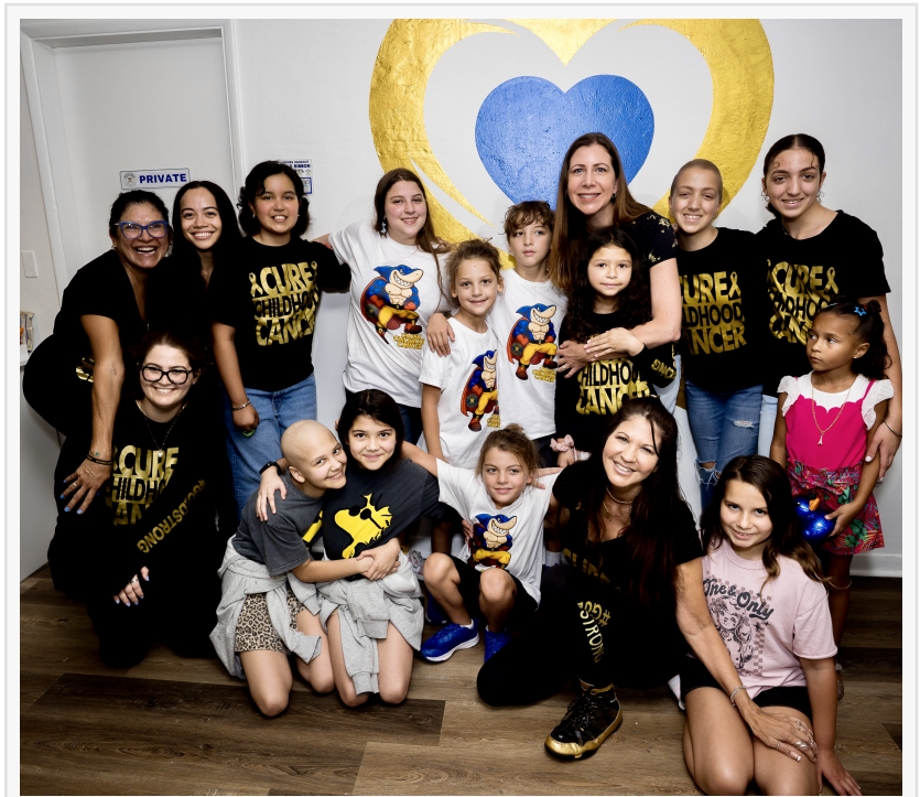
Members of the Mystic Force Foundation surrounded by some of the Childhood Cancer Heroes they continue to fight for.

During meetings on Capitol Hill, Mystic Force Foundation directors and fellow advocates will express gratitude to lawmakers for prioritizing children with cancer while also urging Congress to take the next critical step: significantly increasing federal funding for childhood cancer research in Fiscal Year 2027.