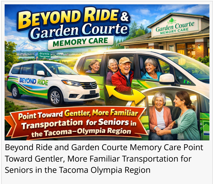
Beyond Ride and Garden Courte Memory Care Point Toward Gentler, More Familiar Transportation for Seniors in the Tacoma Olympia Region

TACOMA, WA, UNITED STATES, February 23, 2026 /EINPresswire.com/ -- When memory care routines and dependable medical transportation align, the result is often felt more than it is noticed. Care becomes calmer. Transitions feel less disruptive. Dignity is preserved in small but meaningful ways. A recent moment in the South Sound offered a quiet example of this possibility when Garden Courte Memory Care attended Beyond Ride's Christmas community gathering.