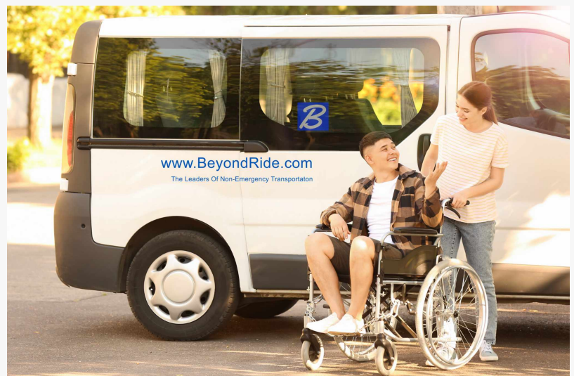
Beyond Ride NEMT VAN Vehicle