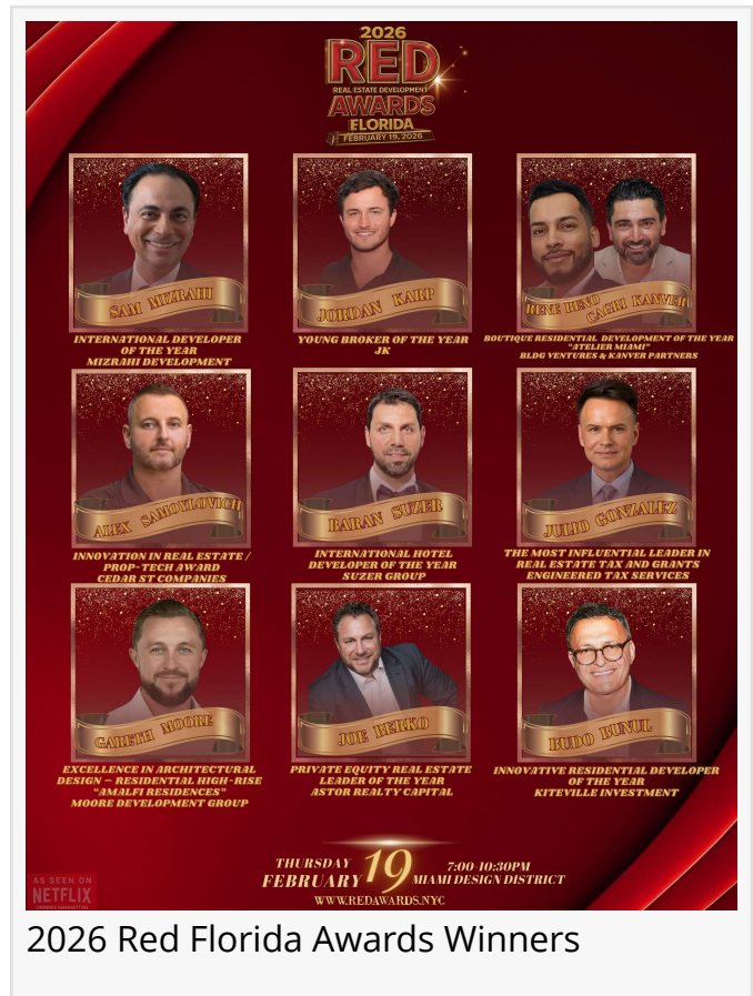
2026 Red Florida Awards Winners

Each year, RED Awards receives hundreds of nominations from across the residential,