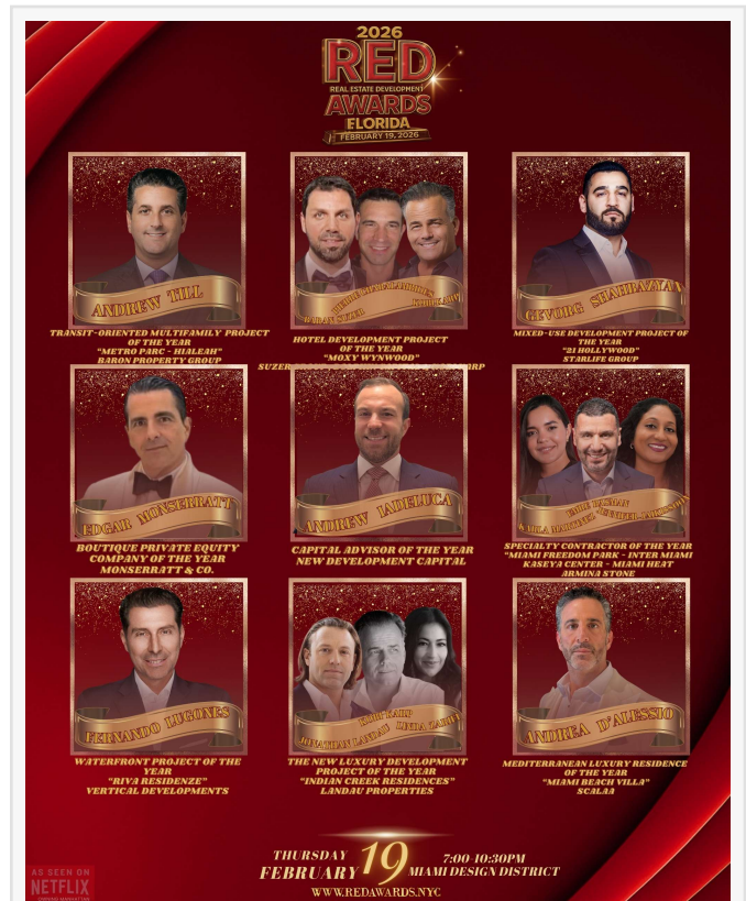
2026 Red Florida Awards Winners 2