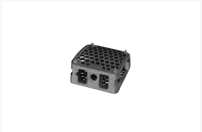
BEE 3D Ti-Cage