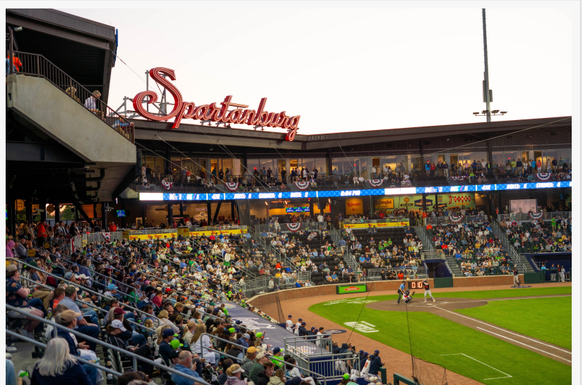
Catch a Hub City Spartanburgers baseball game.

A revitalized downtown, chef-driven dining scene, character-rich small towns and access to outdoor recreation — along with new attractions such as a state-of-the-art planetarium and a downtown baseball stadium — are shaping the destination’s appeal.