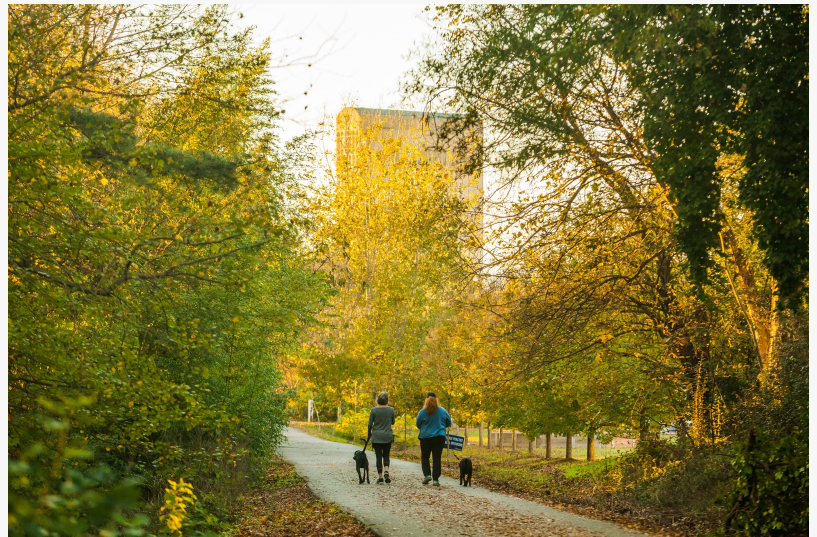
Take a stroll on the outdoor trails across Spartanburg, S.C.

2. Experience Downtown's Vibrant Culinary and Shopping Scene Downtown Spartanburg's appeal starts at the table and spills onto the sidewalks. A compact, walkable core makes it easy for visitors to move from coffee to cocktails, casual bites to white-tablecloth dining — often within the same block. Visitors can step right into a culinary scene anchored by locally loved restaurants. Beyond dining, downtown invites exploration through boutique shopping and public art.