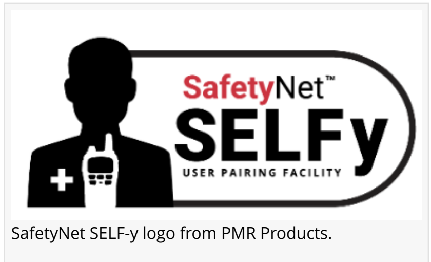
SafetyNet SELF-y logo from PMR Products.

This press release can be viewed online at: https://www.einpresswire.com/article/895122996