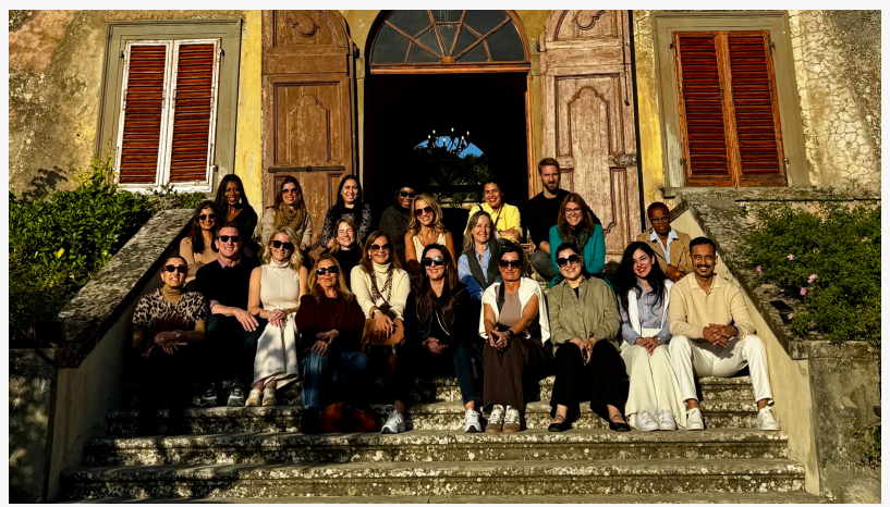
The Wedding Privé's proud associates and members representing Europe, the United States, the United Kingdom, the Middle East, Asia, and many other global regions.

Rather than operating as a directory or open network, the association functions as a curated global collective. Each member is selected for deep regional expertise, discretion, and the ability to operate at the highest tier within their destination. This structure allows families to move seamlessly between Europe, the United States, the United Kingdom, the Middle East, and Asia while experiencing consistency in quality, service, and creative execution. In multi-destination weddings, success is not defined by the number of locations involved, but by how naturally those locations connect. When celebrations transition from one country to another, families expect each chapter to feel intentional rather than disconnected. Without alignment between planners, even the most visually striking events can lose coherence. The Wedding Privé was designed to ensure that every destination contributes to a single, unified narrative.