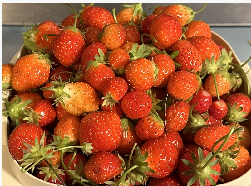
Grower's strawberry harvest from NutriHarvest® 3-3-3. (Image used with permission.)