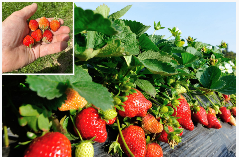
Strawberry field at a commercial farm with home grower’s berry close-up overlay. (Images used with permission.)

BURLINGTON, VT, UNITED STATES, February 26, 2026 /EINPresswire.com/ -- (National Strawberry Day) — Strawberries have a way of turning “I hope this works” into “look at this harvest.” NutriHarvest® is recognizing berry growers and gardeners everywhere and spotlighting a home grower’s bountiful results using an OMRI-listed NutriHarvest® organic fertilizer made with nutrient recovery technology that helps keep nutrients where they belong, in the soil and on the crop, helping protect local watersheds.