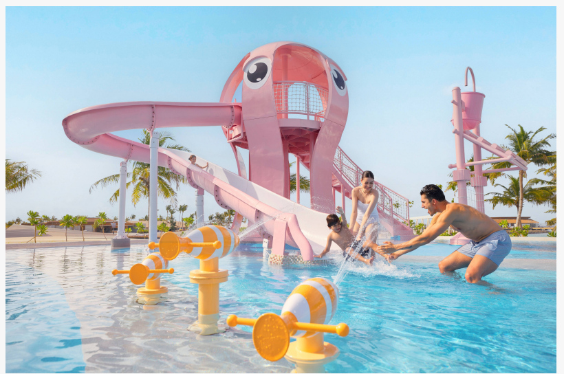
The Mirage Water Park

where children can enjoy edible treatments as well as fun manicures and pedicures, all designed to delight and pamper little explorers in a safe and engaging environment.