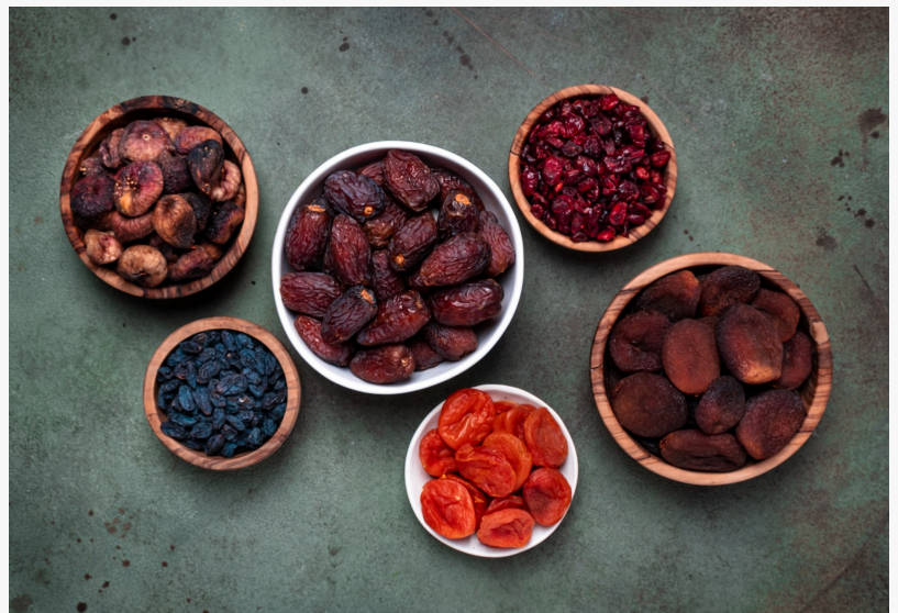
Malatya Apricot - Organic fruits and vegetables 2