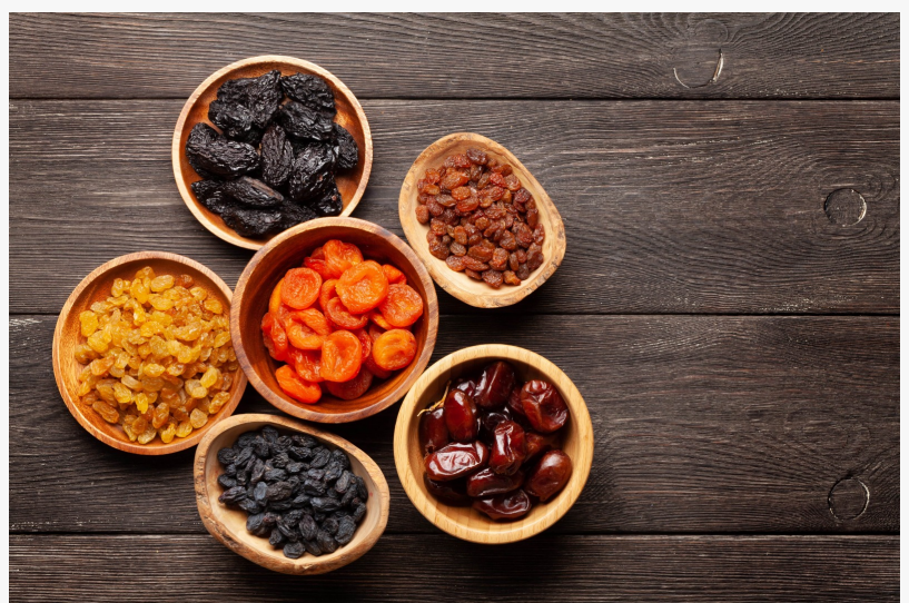
Organic Dried Fruits and Nuts 3

From organic dried apricots and figs to organic dried tomatoes and mixed vegetable blends, this category is expanding rapidly in Europe, North America, and parts of Asia-Pacific. Retail chains, specialty organic stores, and online marketplaces are expanding shelf space for organic dried fruits and vegetables as consumer demand continues to rise.